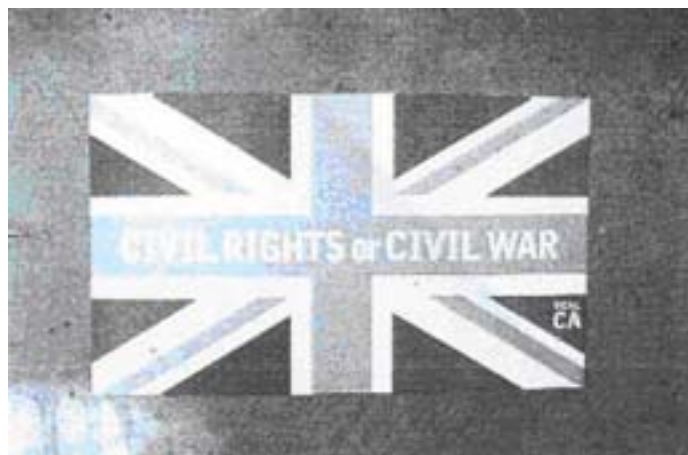
Real Countryside Alliance road sign