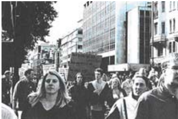
Liberty and Livelihood March, 2002