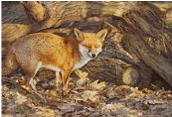
A fox