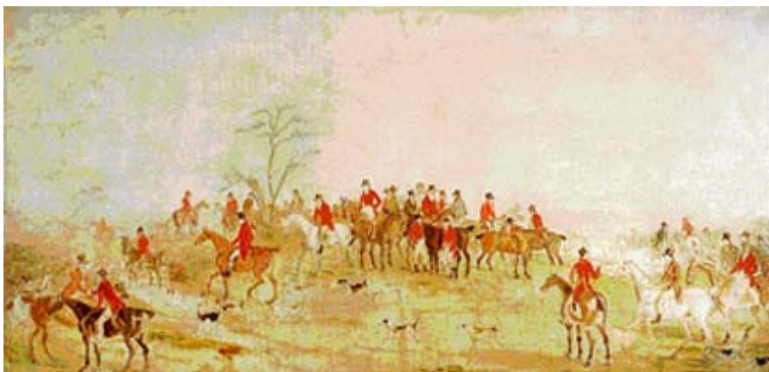
Sketch for the Quorn at Quenby, 1823, by John Ferneley