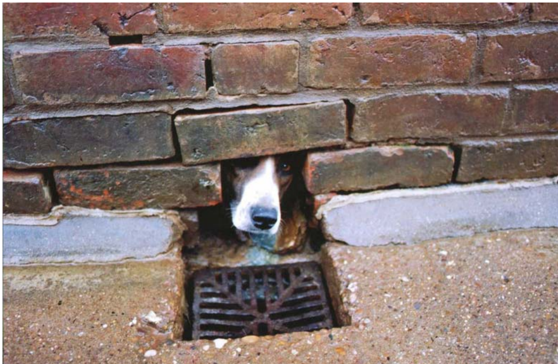
Fox hound peering through a hole in the wall

Write a sentence for each picture explaining why you chose it.